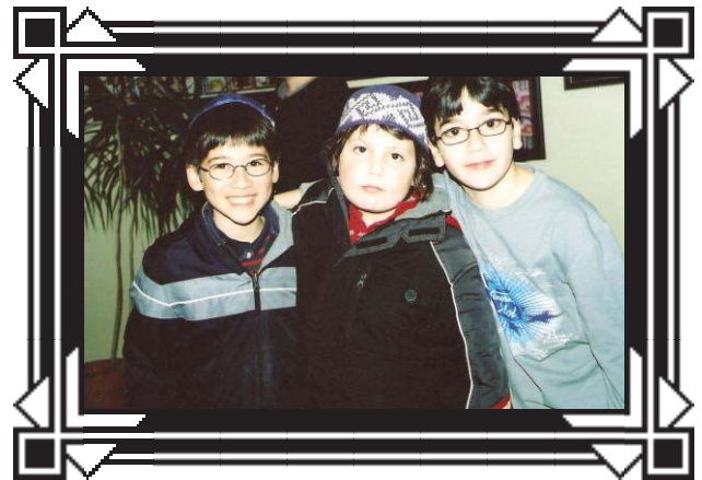
Chanukah 2010 at Sherith Israel