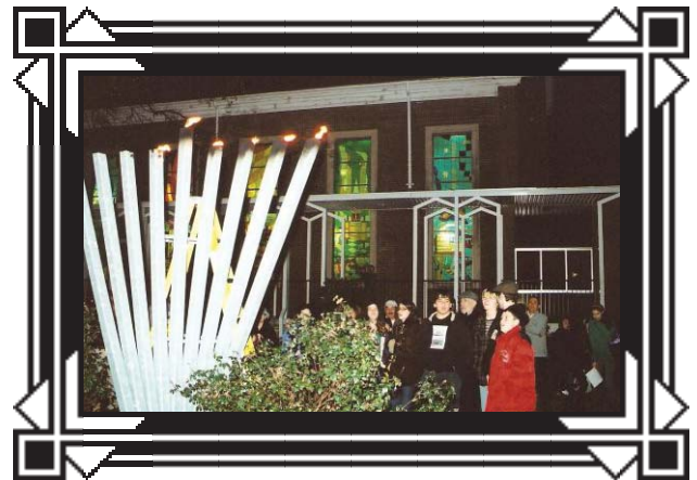
Chanukah 2010 at Sherith Israel