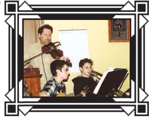
Chanukah 2010 at Sherith Israel